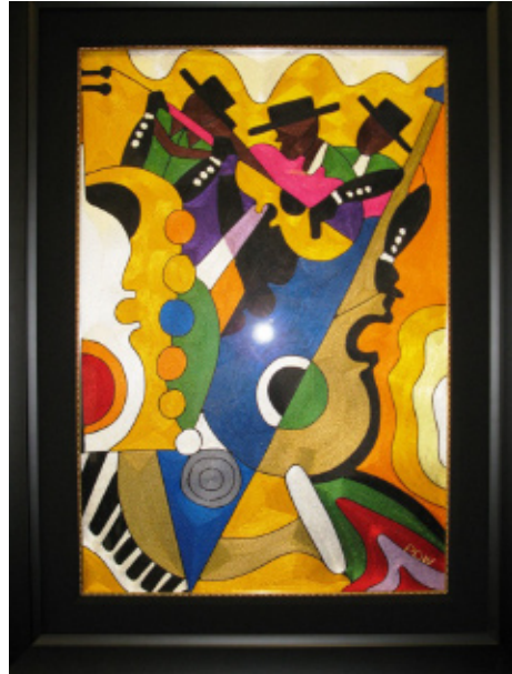
"Jazzy" by Prince Duncan-Williams on display at Village Hall